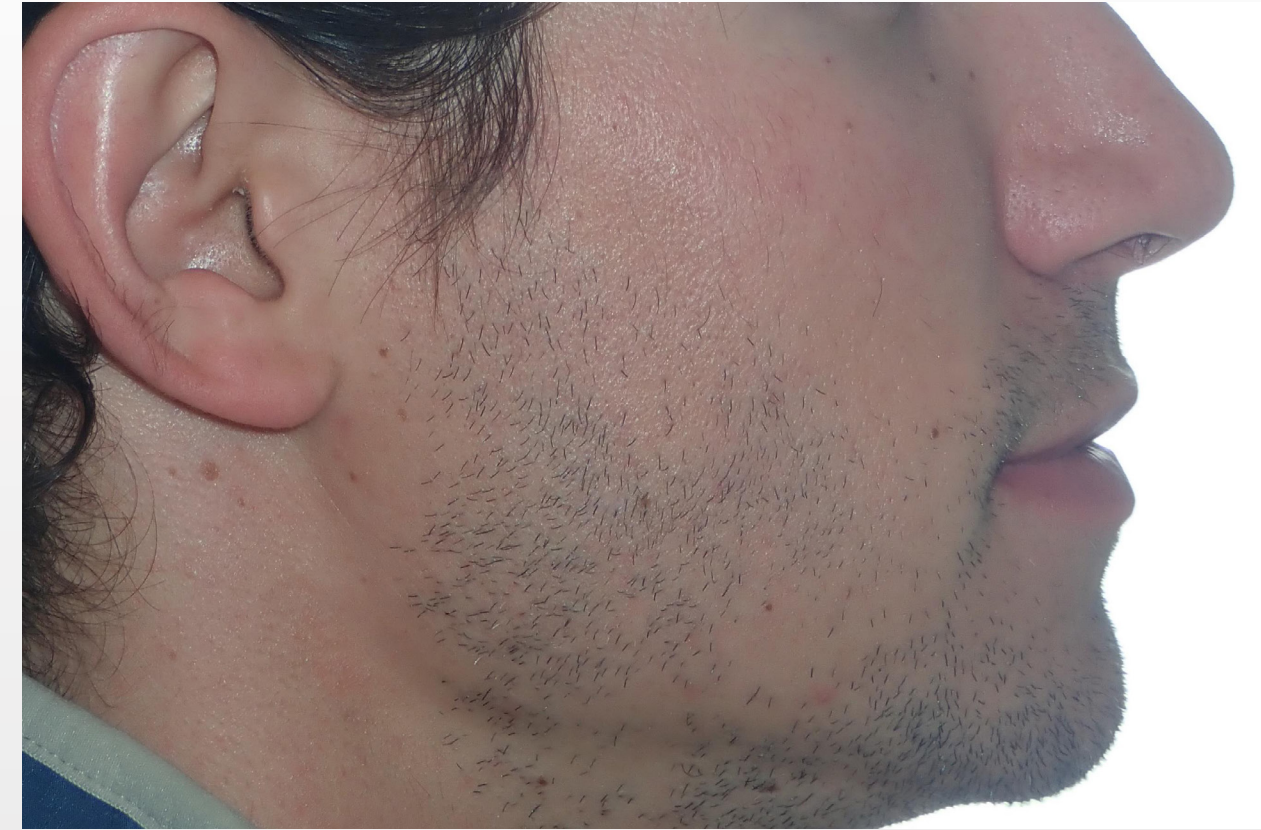
Profile at rest