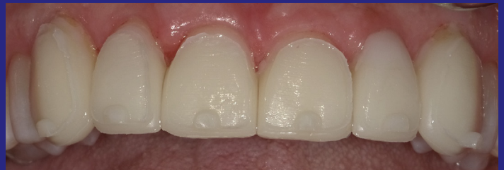
Appearance of Restorations After Matrix Removal