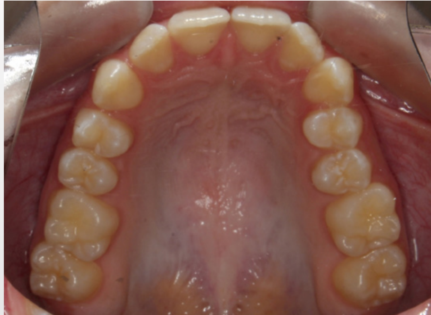
Occlusal – maxillary