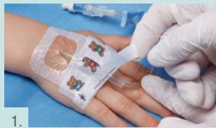
1. Remove securement strips away from dressing.