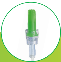
3M™ Curos Tips™ Disinfecting Cap for Male Luers