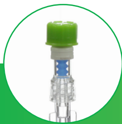
3M™ Curos™ Disinfecting Cap for Needleless Connectors