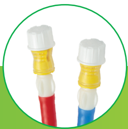
3M™ Curos™ Disinfecting Cap for Tego® Hemodialysis Connectors