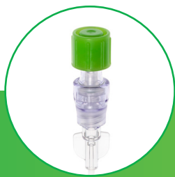
3M™ Curos Jet™ Disinfecting Cap for Needleless Connectors