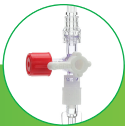
3M™ Curos™ Stopper Disinfecting Cap for Open Female Luers