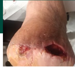
Sub-acute and dehisced