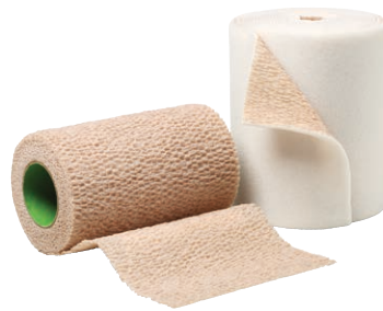
3M™ Coban™ 2 Lite Two-Layer Compression System