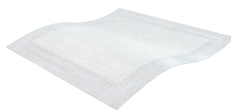
3M™ Kerramax Care™ Super-Absorbent Dressing

Kerramax Care Dressing with advanced Exu-Safe Technology absorbs and retains high levels of serous and viscous fluid away from the periwound skin and wound bed, helping to reduce skin maceration, even under compression. 1,4