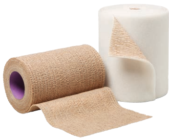
3M™ Coban™ 2 Two-Layer Compression System

Coban 2 compression system is easy to apply and remove, is designed to stay in place, 9,10 and allows for normal footwear, increasing patient compliance and the potential for more effective treatment. 9,11