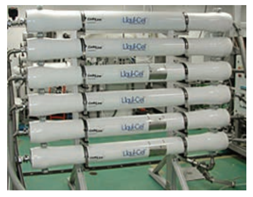
Figure 2: 3M<sup>™</sup> Liqui-Cel<sup>™</sup> EXF-8×80 Series high pressure ASME code- rated degassing system