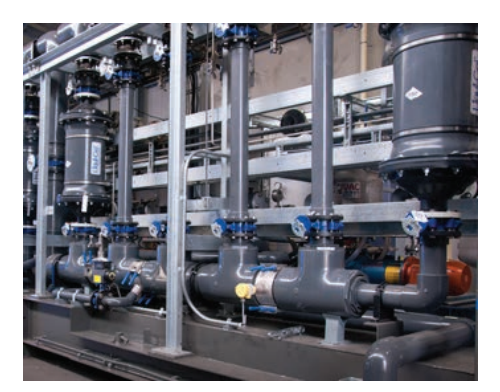
Figure 3. 3M<sup>™</sup> Liqui-Cel<sup>™</sup> EXF-14×40 Series Membrane Contactor in CSG Pilot Degassing System

To meet the water quality standards for re-injection, a water treatment system was built that would include filtration, RO, UV and Liqui-Cel membrane contactors, which are used to deoxygenate the produced water before re-injection. Dissolved O2 concentration levels at the water treatment system outlet should be lower than the dissolved oxygen concentration levels of the formation water.