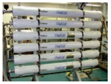
Figure 2. 3M<sup>™</sup> Liqui-Cel<sup>™</sup> EXF-8×80 Series Membrane Contactor System

Now, however, there is increasing discussion and activity around using membrane contactor technology to remove dissolved gases from water in many hydrocarbon related applications. High-pressure 3M<sup>™</sup> Liqui-Cel<sup>™</sup> EXF-8×40 and EXF-8×80 Series Membrane Contactors use a much smaller footprint and weigh far less than deaeration towers – and they do not require chemicals to operate.