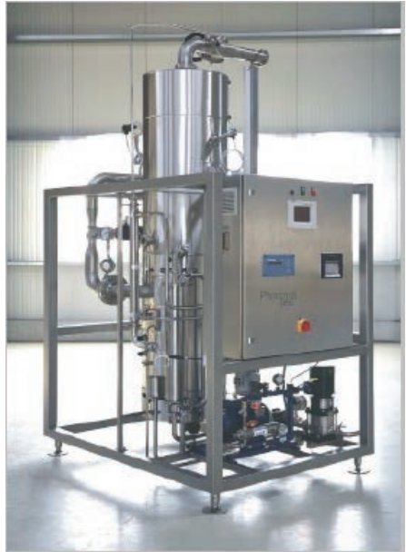
Figure 2. Operating System by Pharmatec GmbH, a Bosch Packaging Technology Company

Technical Information: The technical information, guidance, and other statements contained in this document or otherwise provided by 3M are based upon records, tests, or experience that 3M believes to be reliable, but the accuracy, completeness, and representative nature of such information is not guaranteed. Such information is intended for people with knowledge and technical skills sufficient to assess and apply their own informed judgment to the information. No license under any 3M or third party intellectual property rights is granted or implied with this information.