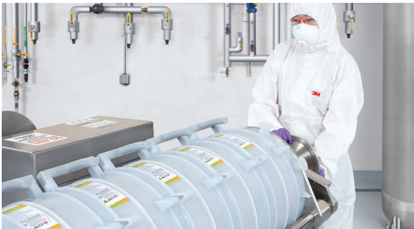
3M™ Encapsulated Production System holder in use

Intended Use: 3M™ Harvest RC products are intended for use in biopharmaceutical processing applications of aqueous based pharmaceuticals (drugs) and vaccines in accordance with the product instructions and specifications, and cGMP requirements (for BC340, BC1020, BC2300 and BC16000) or GLP requirements (for CT15, WP6, BC4 and BC25), where applicable.