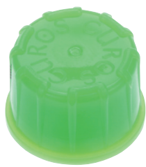
3M™ CuROS™ Disinfecting Cap for needleless connectors