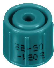
3M™ CuROS™ Stopper Disinfecting Cap for open female luers