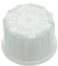
3M™ CuROS™ Disinfecting Cap for Tego® Hemodialysis Connectors